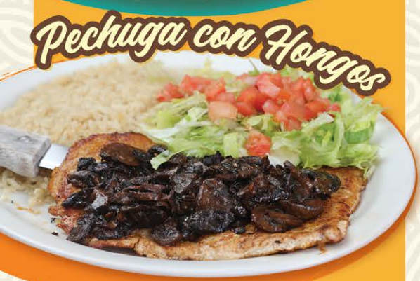
Pechuga con Hongos