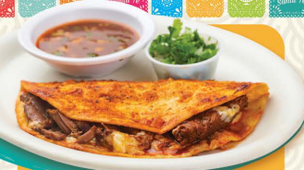
Quesa Birria 9.99 Served with cilantro, onions, lemon, tomatillo sauce.